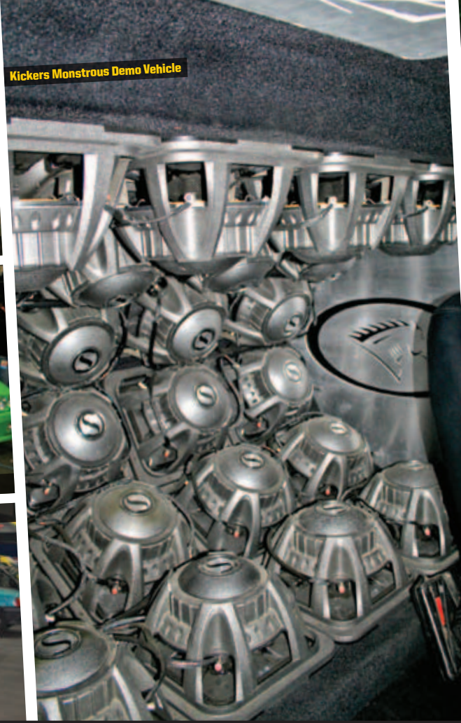
Kickers Monstrous Demo Vehicle