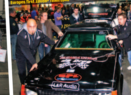
Europes first 180dB+ Team Loud