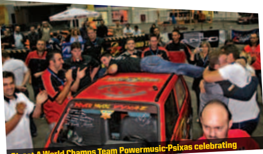
Street A World Champs Team Powermusic-Psixas celebrating