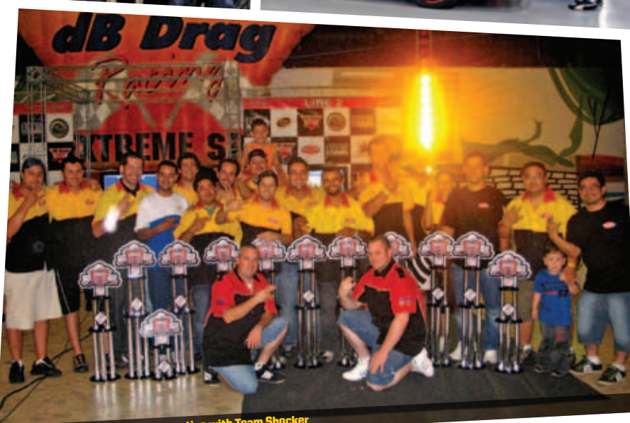
Brazils Head Judges Psychoacoustics with Team Shocker

The weekend was filled with a host of things to do from checking out vendor alley and seeing some of