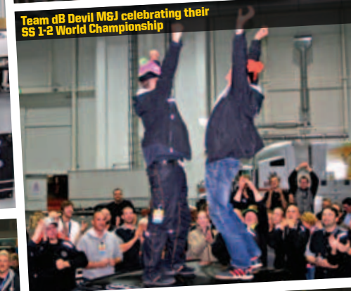
Team dB Devil M&J celebrating their SS 1-2 World Championship