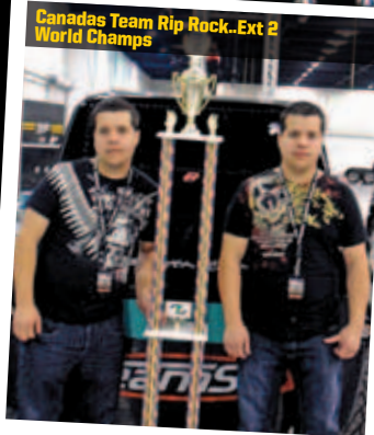
Canadas Team Rip Rock...Ext 2 World Champs