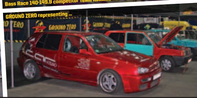
GROUND ZERO representing ...